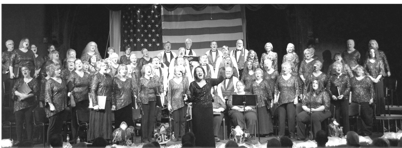
The Northern Michigan Chorale is presenting their holiday concert, "The Gift of Song" at the Great Lakes Center for the Arts on November 17 and 18.